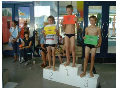
Roopu 5 students, part of Richmond Road School swimming team. Congratulations!

Ruma 12, D'après "Un jour la troupe' campa" Mars 2005